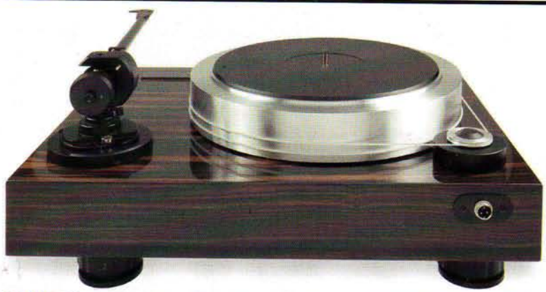
ABOVE: The tonearm cable exits below the plinth and is trimmed according to the arm fitted. The recessed 3-pin connector is for the remote power supply

touches, modulations, carefully positioned sighs. 'Stardust', one of the five most-recorded songs in history, becomes a mini-movie, everything Love Story and a million chick-flicks try to convey.